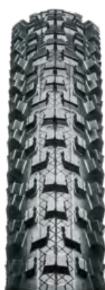
GILA KOLOSS P.58