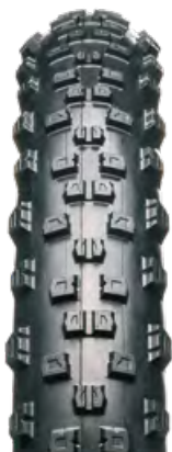
TORO KOLOSS P.58