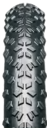
TAIPAN KOLOSS P.58